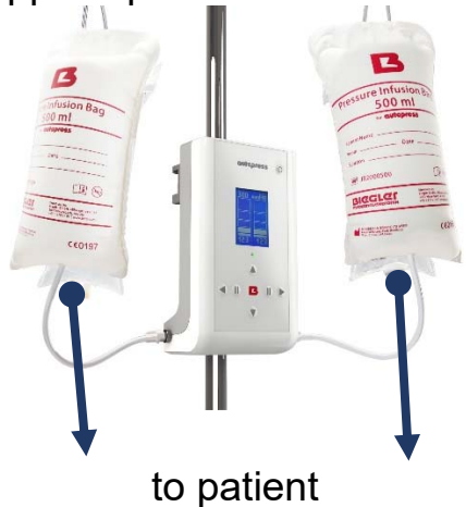
Figure 3 – Applied part depiction

Applied part: venous access (not included)