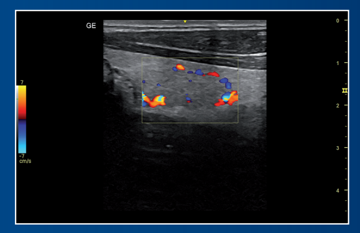
Sensitive color Doppler to examine thyroid vasculature and blood flow in vessels.