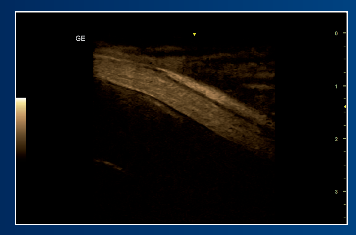
Sensitive B-Flow<sup>™</sup> and B-Flow color imaging to analyze blood flow, diagnose vessel-wall irregularities and stenosis, and more.