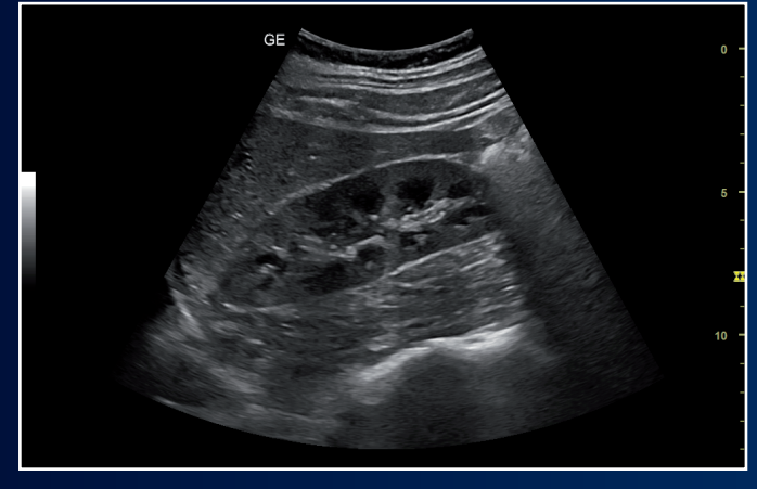
CrossXBeam<sup>™</sup> and SRI-HD to define structure borders clearly.

Versana Premier Black delivers outstanding imaging power and clarity to boost diagnostic confidence. It helps you see clearly, differentiate between tissues, and delineate structure boundaries. You'll enjoy proven functionalities found on most advanced GE systems.