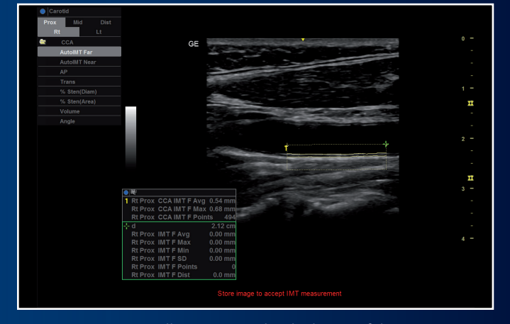
Auto IMT automatically measures the thickness of the Intima Media on the far and near vessel walls.