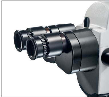
1 Binocular straight lens tube