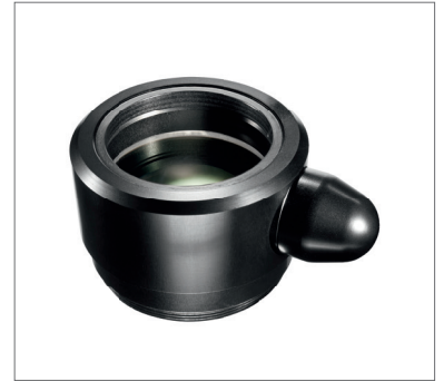
3 Lens with manual focus (200/250/300/400 mm)