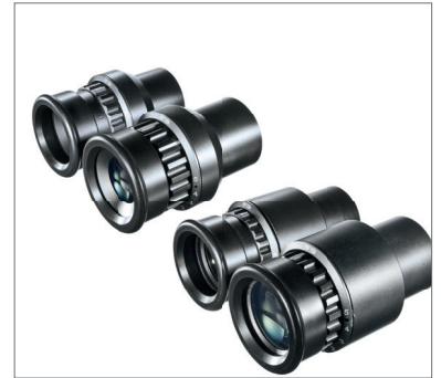
6 Wide field eyepiece lenses 10 x Wide field eyepiece lenses 16 x