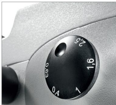
7 Magnification changer