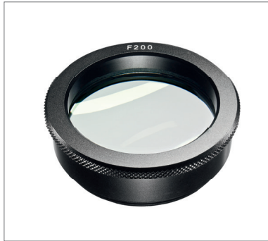
4 Lens (200/250/300/400 mm)