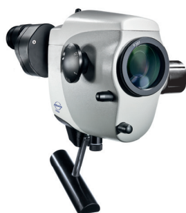
ATMOS® iView 31