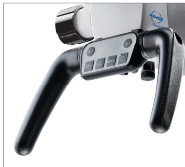
8 Lateral double hand grip