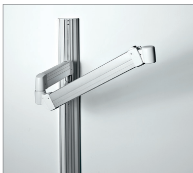
10 Wall stand