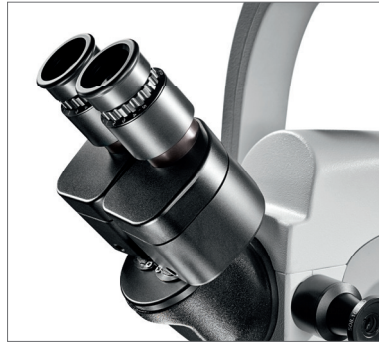
2 Binocular angled lens tube