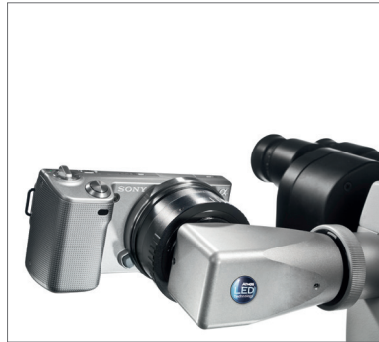
5 HD adapter