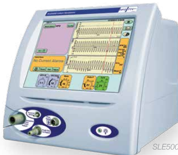
SLE5000 with optional HFO