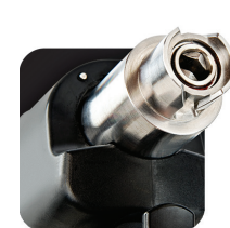
Universal motor 1900-099-000