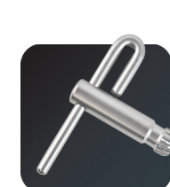
Universal Jacob's key 4100-130-060