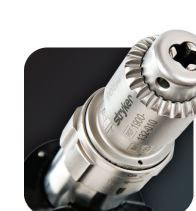
5/32" keyed chuck 1900-132-000