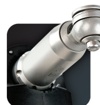
Sagittal saw 1900-034-000

The Stryker F1 System offers five motors, all interchangeable between SmartGRIP Module gripping styles. This versatility allows for customizable sets, so you have only the components you need.