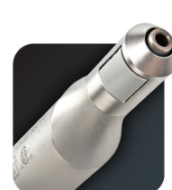
Reciprocating saw 1900-037-000