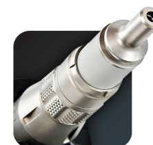
Micro drill 1900-015-000