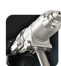
Wire collet 1900-062-000