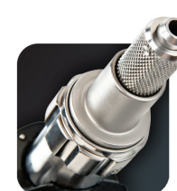
A/O chuck 1900-110-000