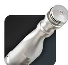
Oscillating saw 1900-031-000