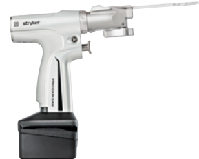
Stryker Precision Saw