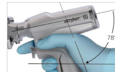
Cordless driver with PoweReam Technology