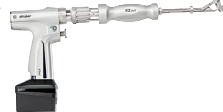
EZout Powered Acetabular Revision System