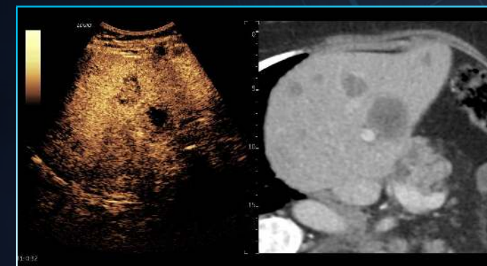
Liver Contrast Enhanced Ultrasound (CEUS) with CT using Volume Navigation, C1-6-D